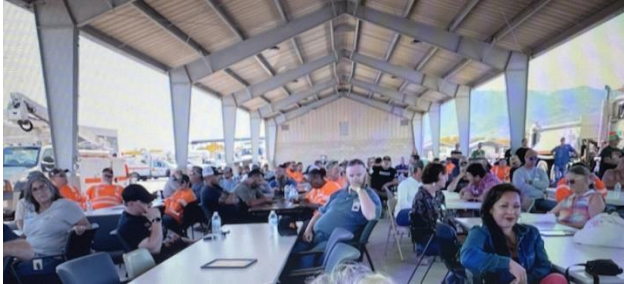
Maintenance Yard on Spruce Street with BBQ tri-tip and potluck for $15.

Caltrans District 09 had a 100-year Anniversary Celebration of the creation of the District on October 18, 2023. It was held at the Bishop